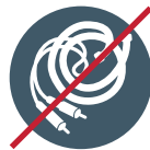
No Cords, Hoses or Chains