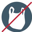
No Plastic Bags or Plastic Wraps (store drop-off only)