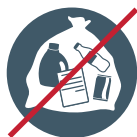
Do Not Bag Recyclables (no trash)