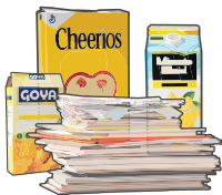
Paper and Cartons