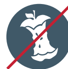
No Food or Liquid (empty all containers)