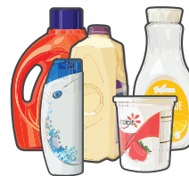
Plastic Bottles, Jars and Jugs (empty and dry)