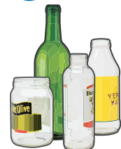
Glass Bottles and Jars (empty and dry)