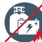
No Flammables, Fuel Tanks, or Batteries